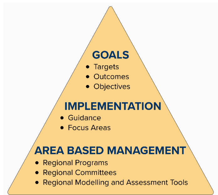
Figure 2: Goals, implementation strategy and tools

Next, the draft 2025 EVWQP provides goals (Section 4), which are supported by an implementation strategy (Section 5) and area based management tools (Section 6), as shown in Figure 2.